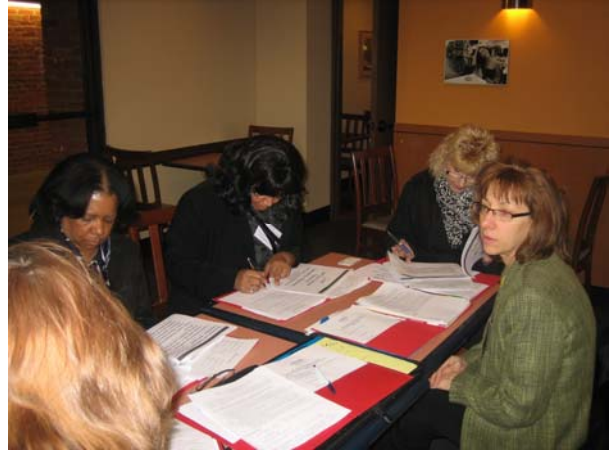
Strategizing in the Senate cafeteria prior to our appointments.